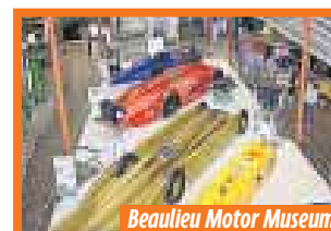
Beaulieu Motor Museum

UNTIL JANUARY 10: Roll up, roll up to the Im-Bru carnival at the SECC in Glasgow. With more than 60 attractions from Superbowl, Waltzer and Ghost Train and Dodgems to adrenaline-fuelled rides like Mega Mix, Speed Buzz